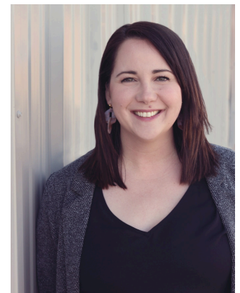
Mayor Lyndsay Montana

With that, I wish everyone a continued safe summer season. Warm regards,