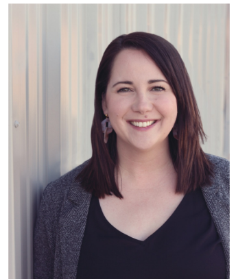
Mayor Lyndsay Montana