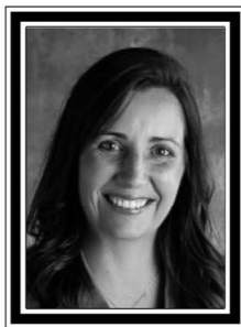
2011 Joined CES