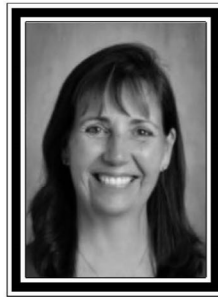
2023 Leaving CES