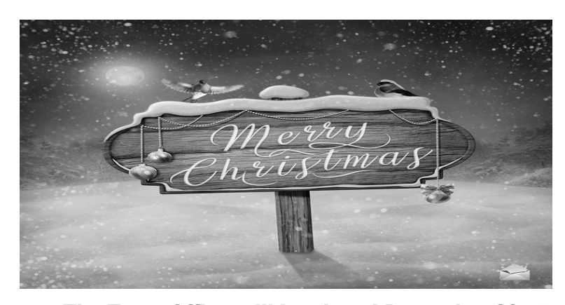
<u>The Town Office will be closed December 23 at 4:30pm and will reopen Tuesday January 3rd 2023.</u>

We want to wish you a happy and safe holiday season and look forward to seeing you in 2023.