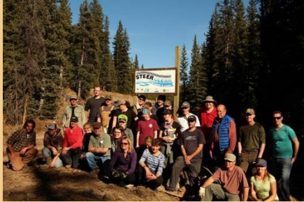
Thank you - Volunteers!

A big thank you to the 50 volunteers who planted willows, gathered leaves, installed signs and built a barricade in Dutch Creek on October 17 and to all the partners and funders for making it possible!