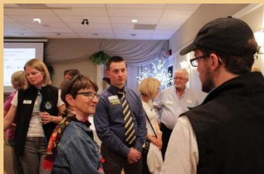
Discussion on the Engaging Recreationists Project

We had our first Lunch and Learn on September 30 to share updates on our Engaging Recreationists and Film Projects and we had many great discussions and networking ice breakers. About 40 people joined us to hear the results from our research over the summer interviewing and surveying off