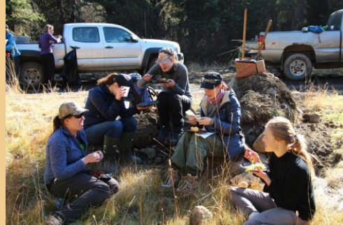
Volunteers enjoying a lunch break

A big thank you to the 50 volunteers who planted willows, gathered leaves, installed signs and built a barricade in Dutch Creek on October 17 and to all the partners and funders for making it possible!