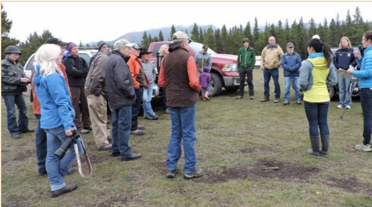
Tour participants learning about linear features classification at Ceasar's Flats in the Dutch Creek sub-watershed, Oldman headwaters.

The next steps for the Headwaters Action Team will be to work with experts to determine a prioritization for reclamation protocol for Dutch Creek - select one or two key areas to start on and begin the process of restoring vegetation and proper ecological function in these areas to protect water and watershed values. Much needs to be done for this to occur - participation with partnerships in government, industry, recreationists, municipalities and other groups is essential. Watershed health and water security is everyone's business - we need to build collaborative action across a full spectrum of stakeholders and the public to ensure that we can complete the Dutch Creek Pilot Project with some significant successes, and then apply this knowledge to other impacted sub-watersheds in the Oldman headwaters.