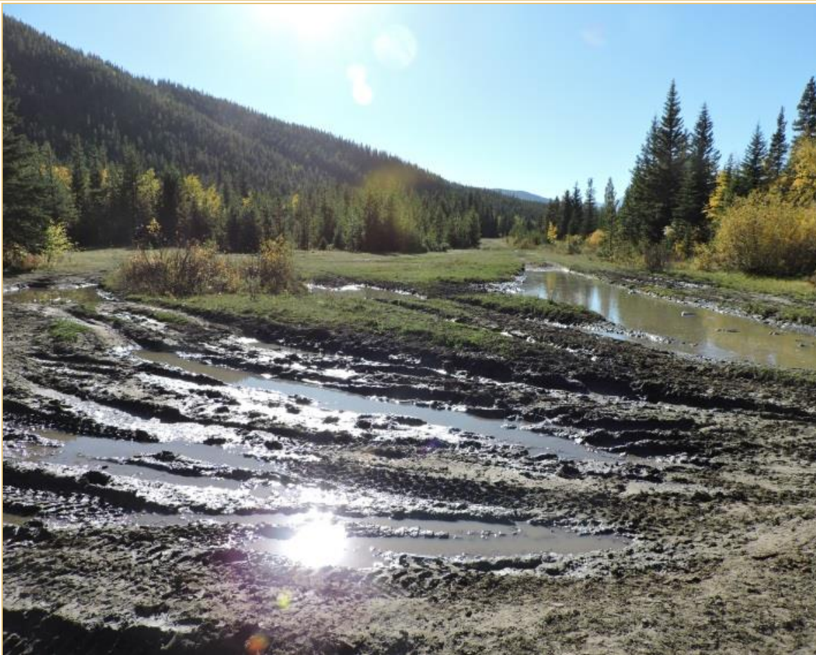
Some trail impacts on meadows and wet areas in the Dutch Creek sub-watershed.