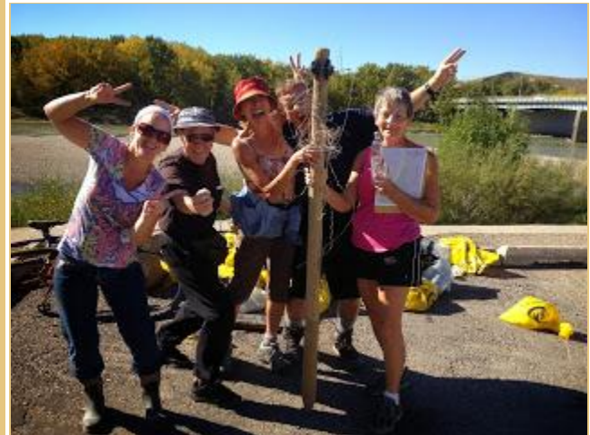
Volunteers having a good time and lovin' the watershed!

Thank you for the generous support of this year's Shoreline Cleanup from organizers at the Oldman Watershed Council and Helen Schuler Nature Centre as well as to Real Canadian Superstore in Lethbridge for providing snacks and drinks for our volunteers.